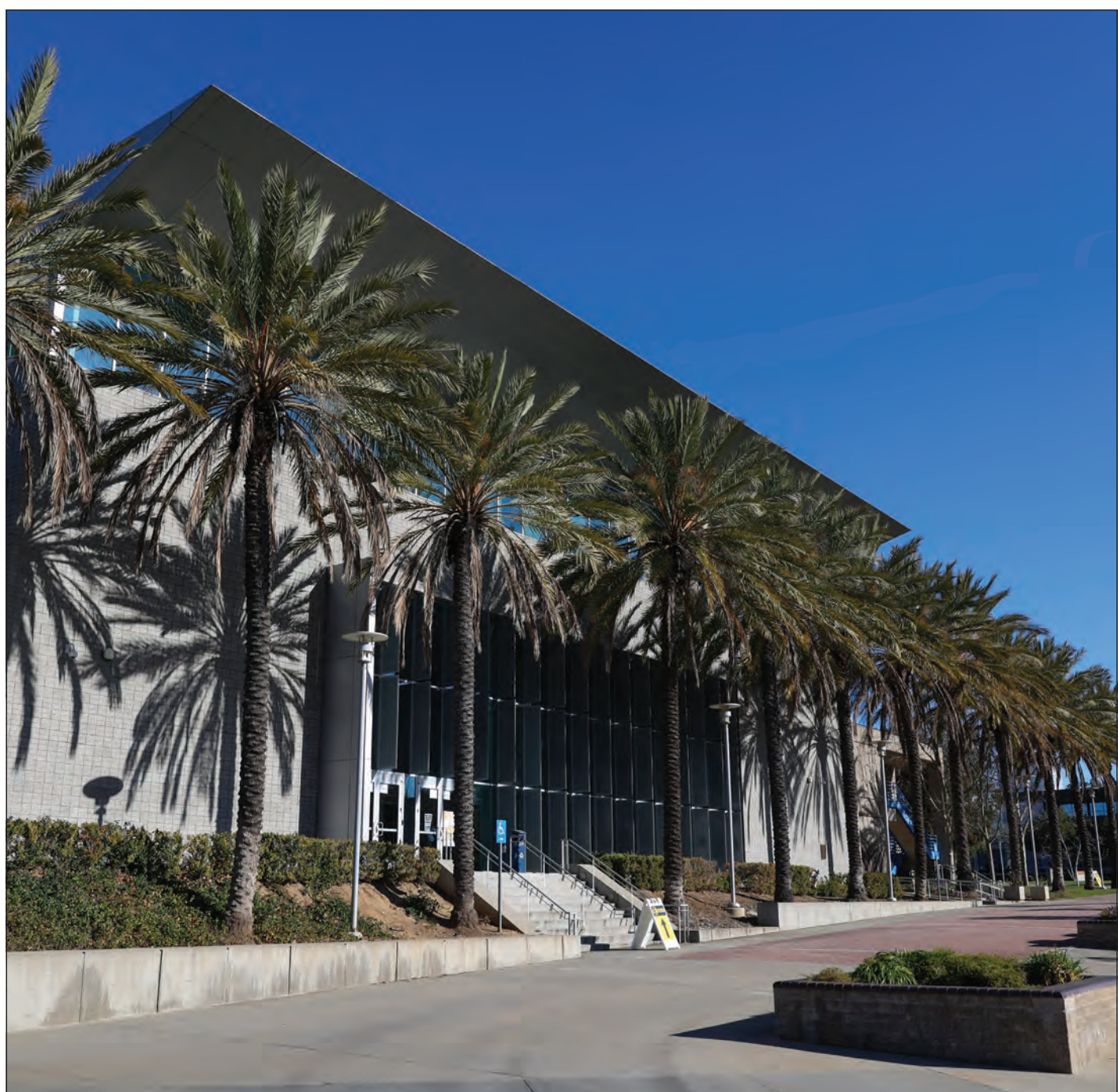
Santiago Canyon College's E Building houses the computer lab.

The rankings are based on academic quality, diversity, student life, and institutional data from the U.S. Department of Education, including the Integrated Postsecondary Education Data System (IPEDS) and Office of Postsecondary Education.