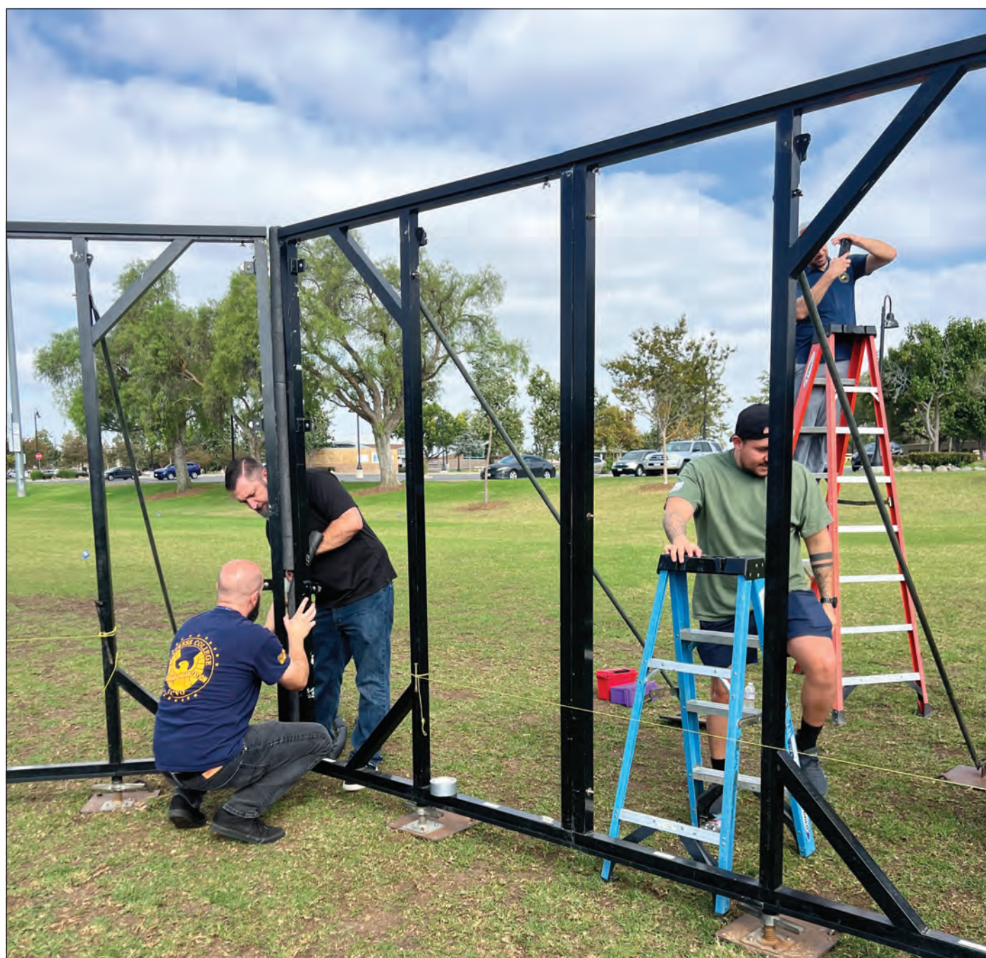
Student veterans got a chance to serve by helping to construct The Wall That Heals, a traveling scale replica of the Vietnam Veterans Memorial in Washington, D.C.

The original memorial measures nearly 500 feet long and more than 10 feet high at the apex, decreasing to ground level at each end.