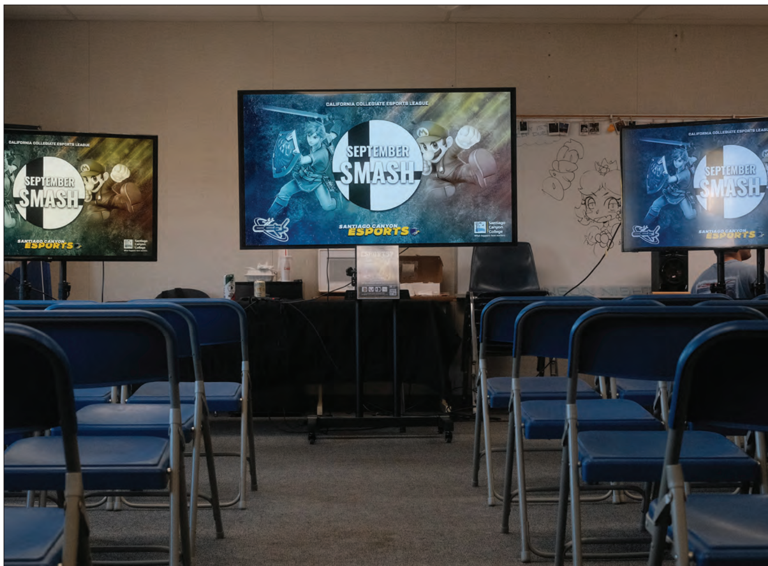
Monitors display the tournament setup in Santiago Canyon College's new Esports Lab at U Village.

The SCC Esports program, which opened its dedicated space in the U-Village earlier this semester, provides students with competitive opportunities while building teamwork, strategy, and digital skills. The program joins a growing list of recognized collegiate Esports initiatives across California.