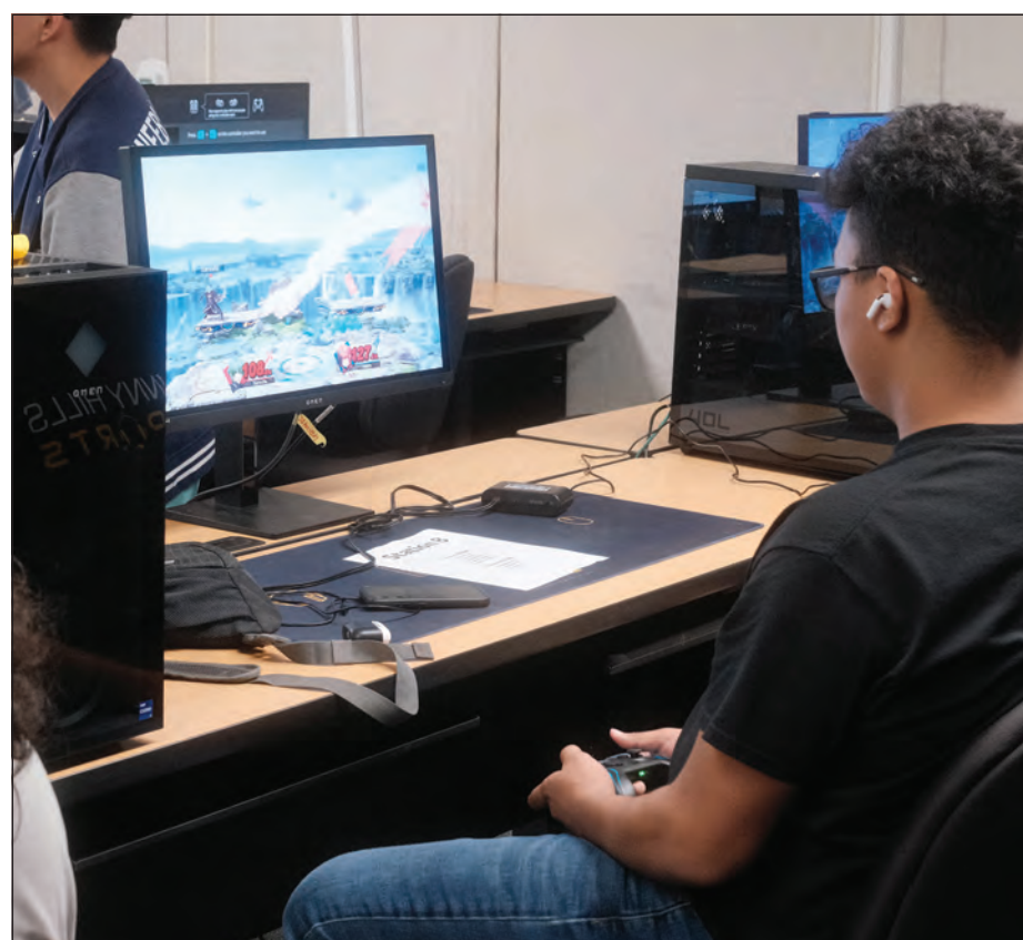
A player competes in the tournament on Sept. 19.