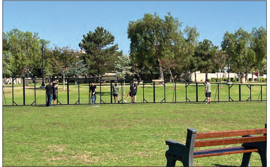
SCC students worked alongside members of the American Legion Post and the Elks Lodge to construct the memorial.